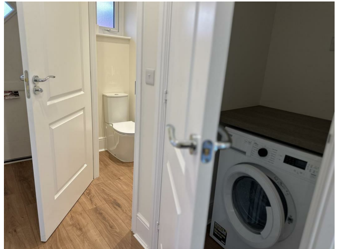
Utility Space 2'10" x 3'0" (0.87 x 0.92)

Under the stairs cupboard turned into a utility space. Includes a washing machine, and offers space for a tumble dryer.