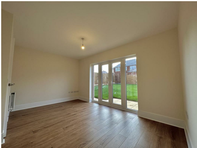
Lounge 15'2" x 10'5" (4.63 x 3.20)

With modern wood flooring, TV Point, central heated radiator and large double doors that lead to the garden. This lounge has plenty of natural light and is extremely spacious.