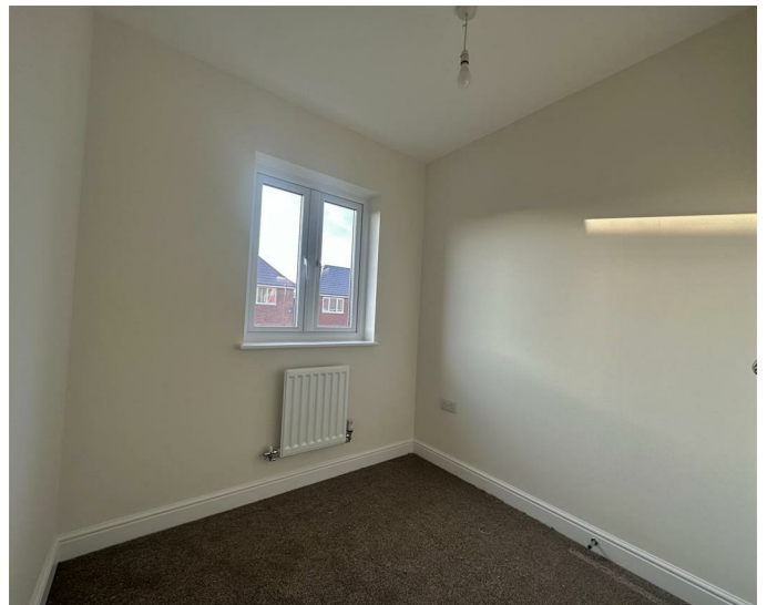
Bedroom 3 6'7" x 7'10" (2.03 x 2.39)

Single bedroom that would also be a ideal as a home office/dressing room. Beige carpet, central heated radiator and a UPVC Window.