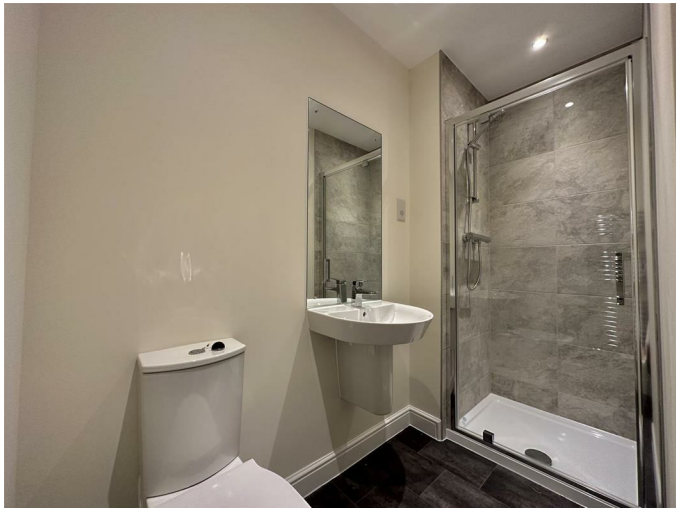
En-Suite 8'3" x 3'8" (2.52 x 1.12)

Three piece en-suite bathroom includes black tiled effect lino, modern shower, heated towel rail and shaving point. Grey tiling completed the look.