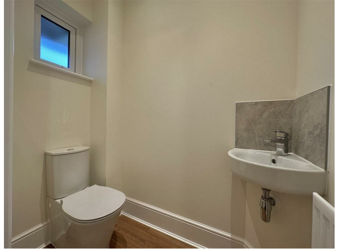
Downstairs WC 5'7" x 3'0" (1.71 x 0.93)

Modern wood flooring, central heated radiator, toilet and a wash hand basin.