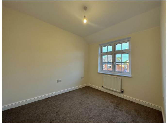
Bedroom 2 8'0" x 9'6" (2.45 x 2.90)

Generously proportioned double bedroom with beige carpets, UPVC window and central heating radiator.