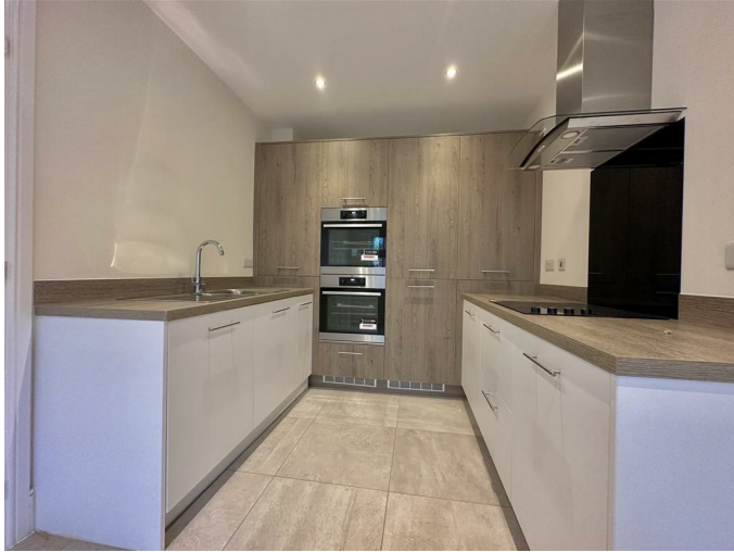
Kitchen / Diner 8'2" x 15'5" (2.51 x 4.70)

This luxurious, high specification kitchen benefits from an electric hob, extractor fan, double oven, an integrated fridge freezer and integrated dishwasher. With light & modern tiled flooring and a large UPVC window, this kitchen diner feels open and has plenty of room the whole family.