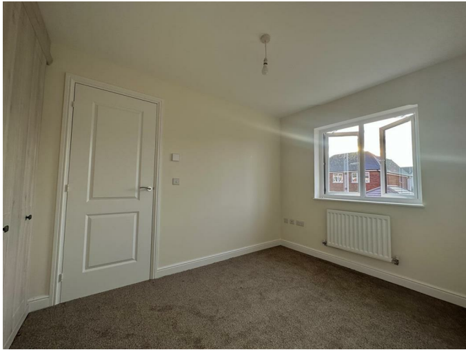
Master Bedroom 8'3" x 11'6" (2.52 x 3.51)

Double bedroom with built in wardrobes, beige carpets, central heated radiator and a large UPVC window, This room benefits of an en-suite bathroom.